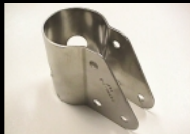
Cutting envelope 55" x 100"